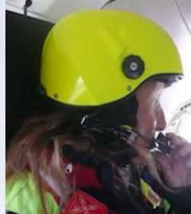
LMT Tech helmet, specially designed for land and air crew