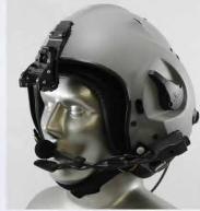
HPH700 Helicopter Helmet