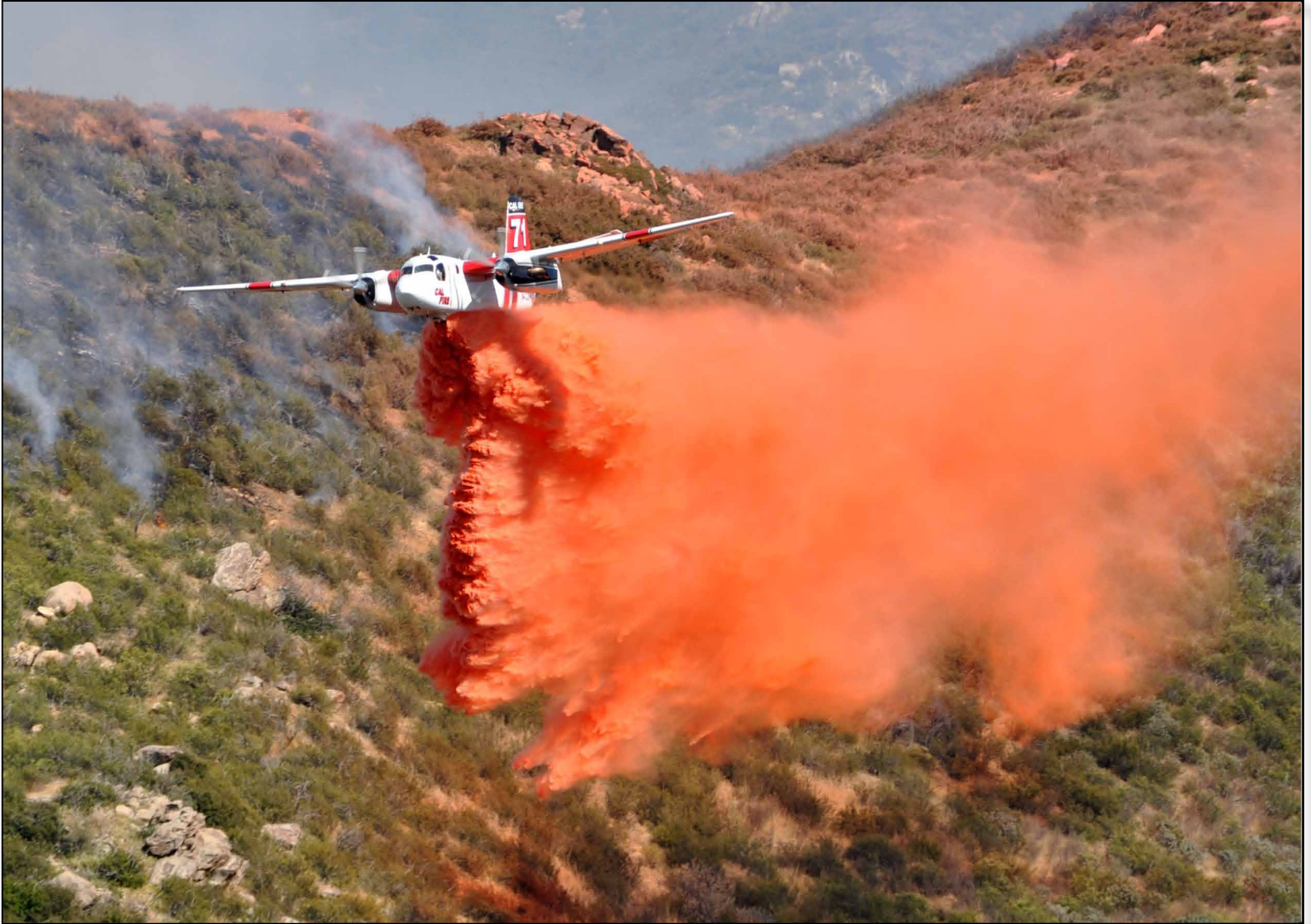
Gorgoino fire.

The California Fire Pilots Association newsletter