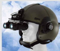
LH350 Helicopter Helmet with NVG