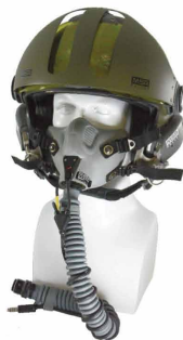
LA100 shown with Oxygen Mask