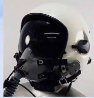
FPH500 Pilot Helmet