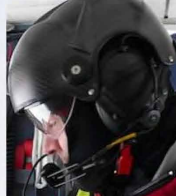
LMT Medic Helmet dedicated to those who need diagnostic maneuvers on the ground or on board