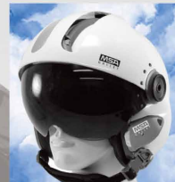
LA100 Jet Pilot Helmet