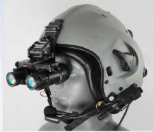
HPH700 NVG Helicopter Helmet