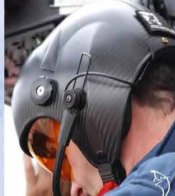
LMT Pilot Helmet dedicated to the flight crew of the helicopter