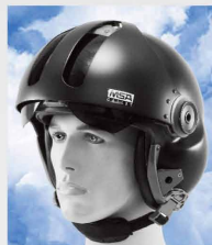
LH250 Helicopter Helmet