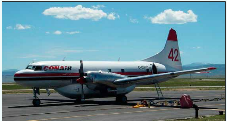
tanker 42, a CV-580, at JEFFCO in Colorado in 2012.

In June of 2012 there were a total of five CV-580s temporarily in the lower 48 states ; one borrowed from the state of Alaska and four