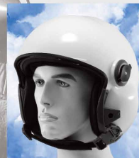
LH050 Helicopter Helmet