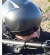
LMT Swat Helmet dedicated to military personnel or military/ballistic