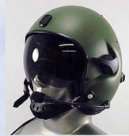
HPH500 Helicopter Helmet